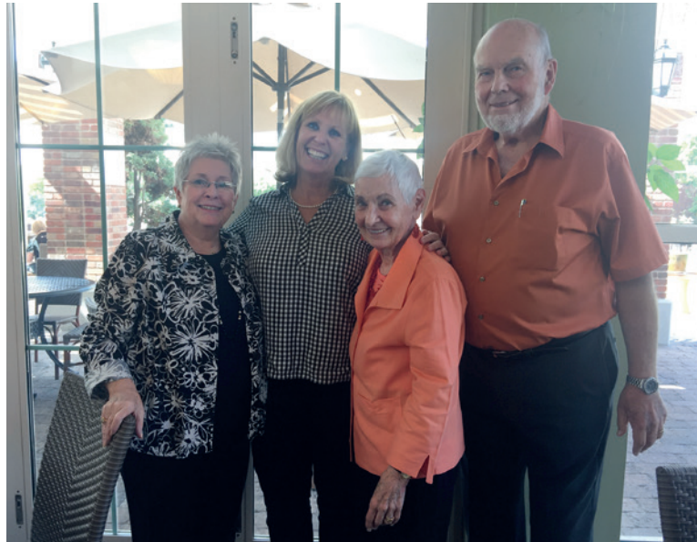
Sunrise Haven on the road in Boise, ID

Because it's also my job to help the community understand our mission, I have made it a goal to visit as many Christian Science churches in the area as possible. So far, I've visited 20 Christian Science churches throughout the Seattle area, in eastern Washington and Boise, Idaho.